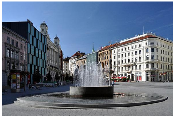
Brno, Náměstí Svobody Square

Brno is known as a venue of various scientific, cultural and sports events. One of the Motorcycle World Championship races takes place at the Brno Racing Track every August. Brno has an excellent road, train and bus connection and the international airport Tuřany with regular connections to London (Stansted, Luton), Moscow (Vnukovo) and Eindhoven. City transport operates 12 tramway lines, 13 trolleybus lines, 41 bus lines, 11 night bus lines and 1 ship line.