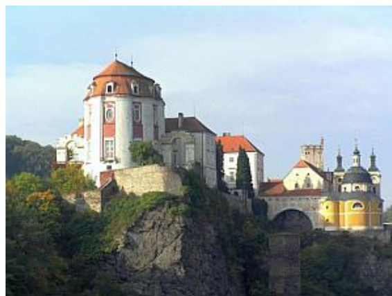
Vranov nad Dyjí chateau