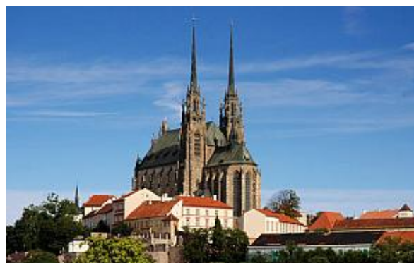
Brno: St. Peter and Paul Cathedral