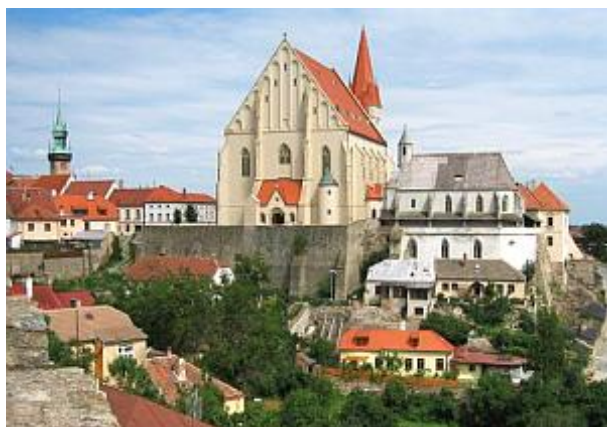
Znojmo town

Way of payment: Bank transfer: Account owner: Mendel University in Brno, Zemedelska 1. Account number 7200310267/0100, variable 2140141. Bank: Komerční banka, Brno - Černá Pole, Merhautova 1, 631 32 Brno; SWIFT (BIC): KOMBCZPPXXX, IBAN: CZ7001000000007200310267. All bank fees are the matter of the debit balance of the participants. Cash by the registration (in CZK only) – all fees excluding the early one. The exchange rate is 1 EUR for 27.80 CZK at the beginning of this August. The simplified tax certificate will be made after the payment.