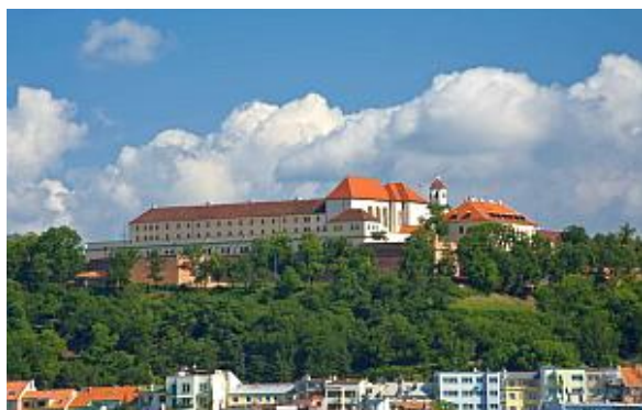
Brno: Špilberk castle