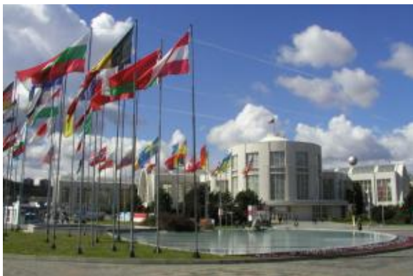
Brno, Fair grounds

The metropolis of historical Moravia and the second largest city in Czechia - Brno has population of about 400.000 people. Its modern history is more than 800 years long. The city has always been an important trade, administrative, transport and cultural centre. It was one of the first industrial points of the former Austrian-Hungarian Monarchy. At the present time, the educational function represented by 84.000 university students is the most important in the city. This potential is completed with 13 Institutes of the Czech Academy of Sciences and with the Czech Technological Park. Social infrastructure includes 6 public and state universities, 15 colleges, 12 hospitals, 14 theatres, 38 galleries, 16 museums, 60 churches, 43 public libraries and a Zoo. The commercial tradition is represented by Brno Trade Fairs (23 different types of events per year).