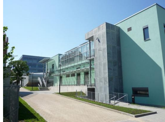
The "M" building, where the conference will take place

The Conference will be held in the "M" building – a new facility built last year. The auditorium M2.11 is situated in the 2 nd floor.