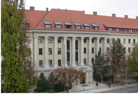
The main building of the Mendel University in Brno (built 1915)