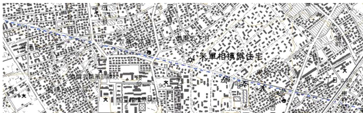
Fig.1: Yokohama Waterway (in Higashi-Rinkan and Asamizodai Area, densely-developed suburban residence)