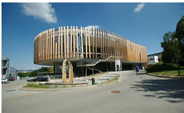
The dining room in the campus