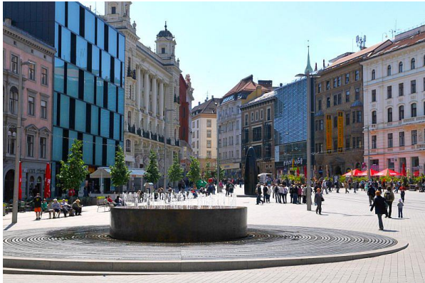
Brno, Liberty square