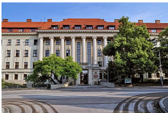
The main building of the Mendel University in Brno