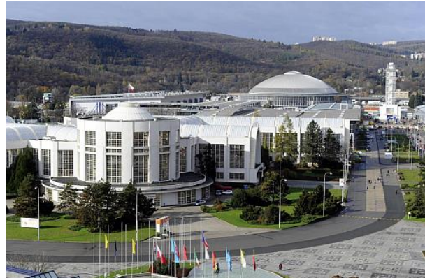
Brno, Trade Fair Grounds