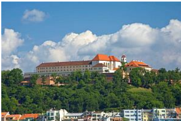
Brno: Špilberk castle

Using past experience, we decided to modify the structure of the conference by emphasizing discussions, excursions and social events. We are aiming at a creation of a new form of the conference. However, we partly keep the traditional sections for oral presentations, poster session and publication of long abstracts for those who prefers it. We presuppose that the participants of the conference will contribute to the organization by selection of the workshops topics and social events. Additionally, we intend to prepare individual programmes for participants according to their preferences by combination of technical and social events.