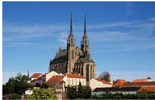
Brno: St. Peter and Paul Cathedral

The conference is open for all scientists, including Ph.D. students, dealing with rural matters from universities, research institutions or other public or private bodies from European countries and around the World. English is the official language of the Conference.