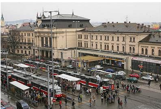
Brno, in front of the Main railway station

In order to offer you the publication of your presentation in an international journal, your full papers will be submitted to European Countryside - if you wish - for a limited price of EUR 75 (payable after the acceptance of the paper). It is also possible to pay for the publication within the conference fee (in such a case for EUR 60 per a paper). European Countryside is a double blinded international on-line journal [ http://www.degruyter.com/view/j/euco ] with completely free access for its readers covered by many databases, including Elsevier SCOPUS. This fact creates a relatively high probability of quotations of the articles. Your papers can be delivered any time between payments of your conference fee and August 2020. The papers must follow the instructions for authors of European Countryside [ http://www.european-countryside.eu/submit.html ]. They will pass through standard per-review procedure which is the pre-condition of their publication.