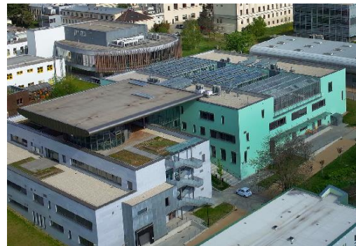
The "M" building, where the conference will take place