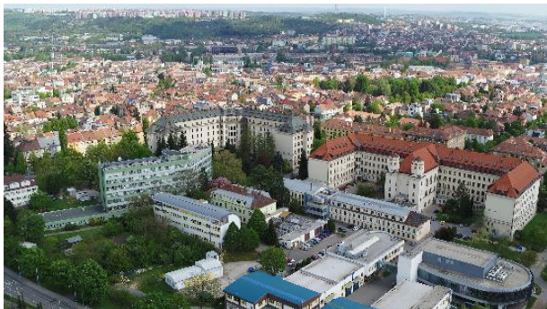
The main campus of Mendel University in Brno