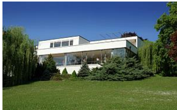
Brno, Tugendhat Villa – a part of the UNESCO world heritage