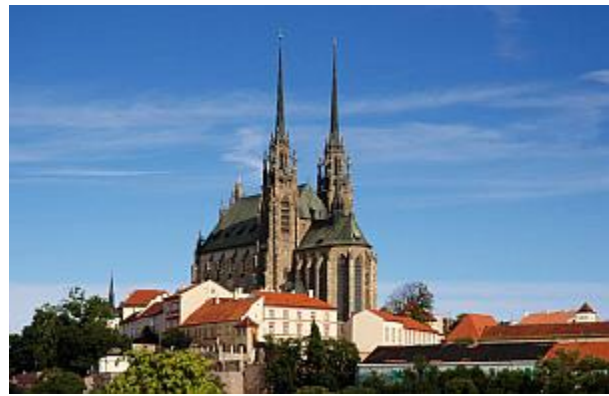
Brno: St. Peter and Paul Cathedral