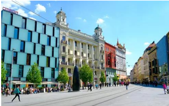
Brno, Liberty Square

To offer you the publication of your presentation in an international journal, your full papers will be submitted to European Countryside - if you wish - for a reduced price of EUR 175 (payable after the acceptance of the paper). It is also possible to pay for the publication within the conference fee (in such a case EUR 150 per paper). European Countryside is a reviewed international online journal [ http://www.degruyter.com/view/j/euco ] with completely free access for its readers. This fact creates a relatively high probability of quotations from the articles. The journal is covered by the SCOPUS database (CiteScore 2.9 for 2022), and by the Clarivate Analytics within the ESCI database (JCI 0.55 for 2021) among others. Your papers could be delivered at any time between payments of your conference fee and August 2025. The papers should respond to the instructions for authors of European Countryside [ http://www.european-countryside.eu/submit.html ]. They will pass through a standard per-review procedure which is the pre-condition of their publication.