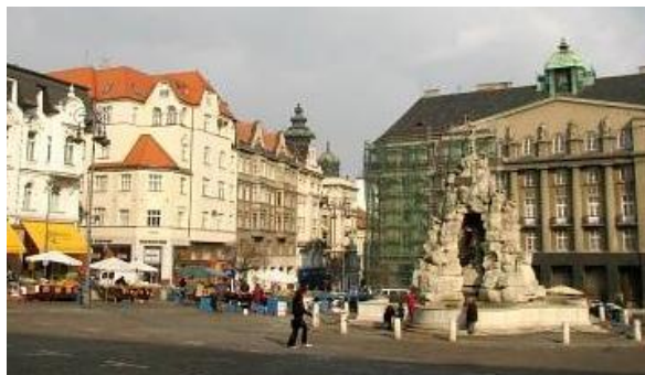
Brno, Cabbage Market