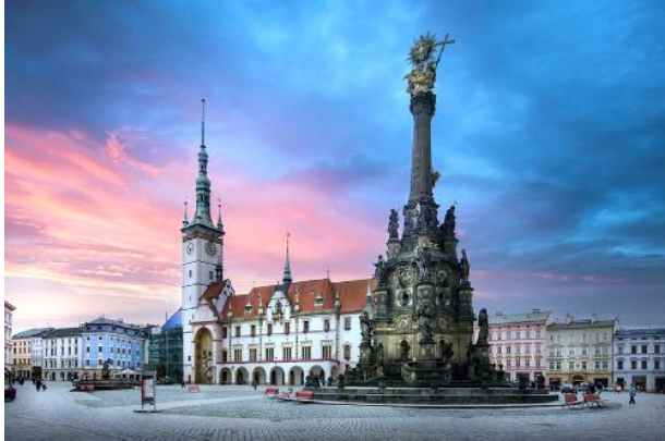
Olomouc, city core

Hotel reservations are a matter of participants. We suggest you following variants: Barceló***** for those who prefer luxury, GRAND hotel Brno**** (in the place where all means of public transport meet). In the walking distance from the University, we can recommend hotel Passage****, hotel Bobycentrum, hotel VAKA or hotel EUROPA. For those who are looking for a cheaper accommodation, we can recommend student hostel ACADEMIA of our University. Since September will still be the main tourist season, we recommend solving the issue of accommodation well in advance.