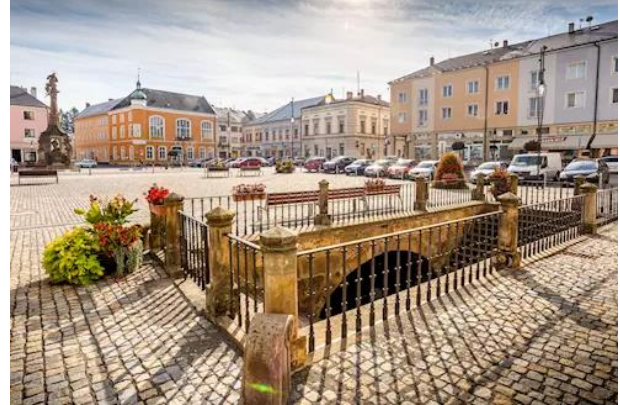
Litovel: city monument zone

We do not provide transport for participants to the conference. For possible connections by public transport see https://idos.idnes.cz/en/vlakyaubusymhdvse/spojeni/ For transport within the city of Brno, we recommend public transport. Transport by private cars could encounter a rather complex parking system. Public transport in Brno carries an average of more than a million passengers per day. It operates 24 hours a day, 365 days a year. Seniors over 70 ride for free, people aged 60–65 with a 50% discount. A full ticket (60 minutes) costs 25 CZK (approx. 1 EUR). The optimal system for foreigners is the beep and go system, where it is enough to attach a Visa or MasterCard card to the reader to pay the fare.