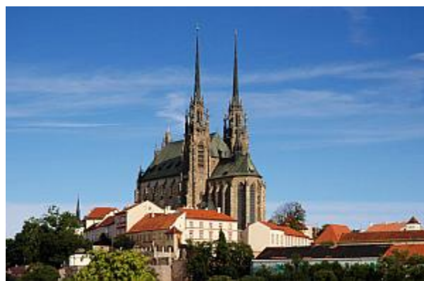
Brno: St. Peter and Paul Cathedral