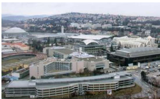
Brno, Fair grounds

Mendel University is the third largest and the fourth oldest university in Brno. It was founded in 1919 as the Agricultural College. At the present time, 8,900 students, of it 20% from abroad study at one of five faculties: AgriSciences, Forestry and Wood Technology, Horticulture (situated in Lednice, South Moravia), Business and Administration, Regional Development and International Studies and at the Institute of Lifelong Learning. The University uses the University Training Farm at Žabčice and the Forest Training Enterprise "Masaryk Forest" at Křtiny. Student accommodation facilities provide 3,148 beds. The library disposes with more than 400,000 issues, being the 4 th largest library in the City.