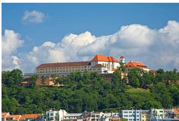
Brno: Špilberk castle

We have the honour of inviting you to the EURORURAL '24 conference on EUROPEAN COUNTRYSIDE AND DE-GLOBALIZATION. It is the 8 th of Moravian rural conferences organised by the Department of Applied and Landscape Ecology, Faculty of AgriSciences, Mendel University in Brno. The aims of the conference are as follows: to map contemporary European rural research and the particular interests of investigators, to gain space for the presentation of topical knowledge about rural research, to continue the tradition of international conferences dedicated to rural problems, to support personal contacts among experts of different disciplines dealing with rural problems, to present Moravian rural landscape. The conference is aimed at the complex view of rural problems from different viewpoints (landscape ecology, geography, demography, sociology, economy, territorial planning), less at the research of specific problems in detail.