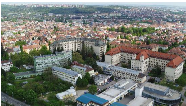
The main campus of Mendel University

The 3 rd Circular with updated information and division of participants into sessions will be distributed just before the event in the mid-August of 2024. If you want to obtain the next information you can simply give us your e-mail address at eurorural@seznam.cz .